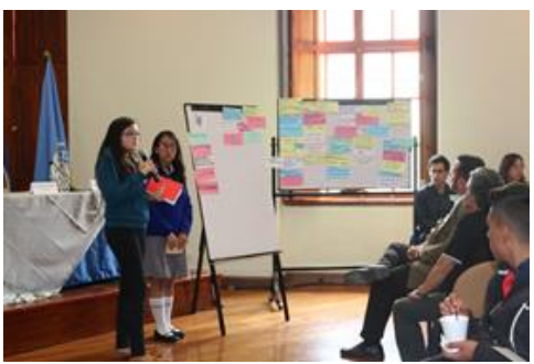
Students explaining perceived health problems in their neighbourhoods. Quito

The practices do face various challenges and risks, according to personnel from DMQ. There is a risk that the mechanisms used do not adequately represent specific groups like youth, women or children. In some areas the culture of participation is weaker than others. To address this, the programme is setting up specific efforts to incorporate these groups into the participatory mechanisms, and ensuring that people elect their representatives. DMQ is also aware of the need to ensure that private actors like companies are included for them to play their role and that all actors get the necessary capacity support to play their role. The process raises expectations from community members, and these need to be managed, especially as building the capacities and shared understanding take time, and given the limited resources DMQ have to address the expectations.