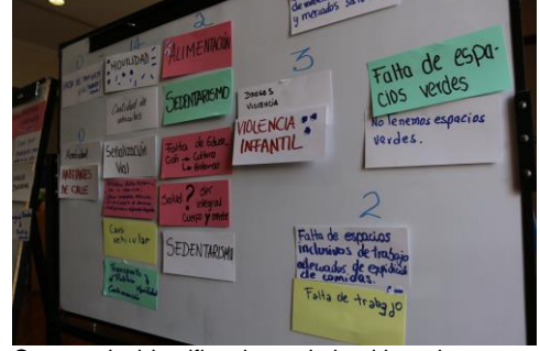
Community identifies the main health and determinants of health issues in the Parroquia Centro Historico of Quito.

Other sectors include opinion leaders of their sector (education, health, etc.) within the parroquia. The selection process for interested candidates for the community teams is being led by the Secretaría de Salud and is currently underway.