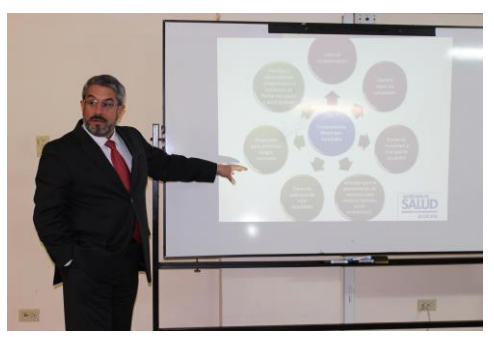
Secretary of Health - José Ruales giving a training to the Steering Committee \,\, \textcircled{}^{\circ} LJurado 2017

See also the Ecuadorean Ministry of Health <u>Programa de</u> <u>Municipios Saludables Program Guide</u> a local tool used in the training and programme.