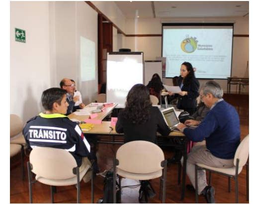
MDMQ steering committee meeting, Quito LJ Lurado 2016

Residents are involved in and build ownership of the process through their own awareness raising and local 'priority setting' workshops that DMQ holds in local neighbourhoods with residents. These workshops use the evidence gathered by DMQ but also the issues perceived by the communities. In 2017 DMQ will engage further with civil society organisations and explore further methods for participatory mapping and needs assessment by communities. The workshops with civil society from selected neighbourhoods review the health evidence from DMQ, add or collect additional information of interest to residents, prioritize health problems of each locality and develop a road map with activities for the neighbourhood and city level. The responses are organized in an intervention proposal that is presented to the mayor for approval and implementation.